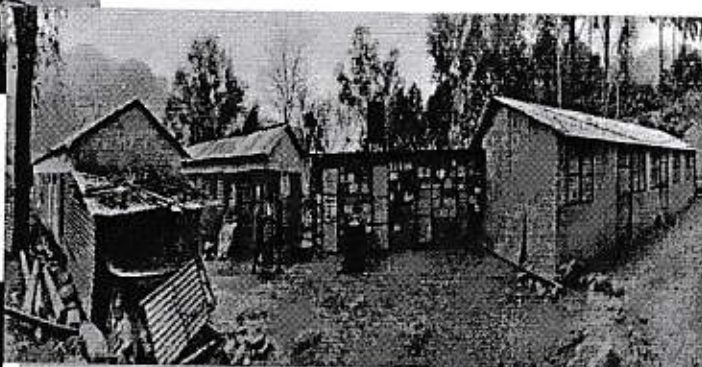
Child Care Home (Transit Home), MANK