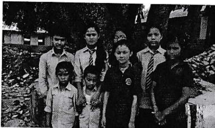
Figure 1 Children in MANK in earlier days